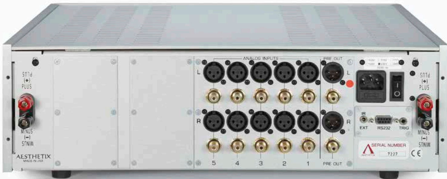
▲ Output stage section left and right, five inputs and one pre-out in cinch and XLR, plug-in options for DAC and phono board – thoroughly equipped

For those who still haven't had enough, the standard headphone output can be replaced with a high-quality class-A-technology one, featuring 1 watt of power into 32 ohms - unfortunately there is no price yet. Another practical feature is